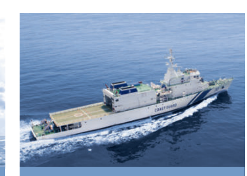
India | Indian Coast Guard | "Vishwast" class 4x Series 20V 8000 M90 @ 9,000 kW each