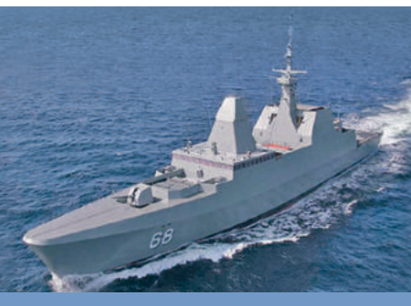
Singapore | Singapore Navy | "Formidable" class 4x Series 20V 8000 M90 @ 8,900 kW each