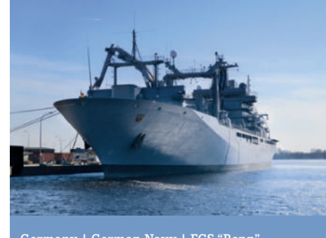
Germany | German Navy | FGS "Bonn" 2x Series 20V 8000 M71R @ 7,200 kW each