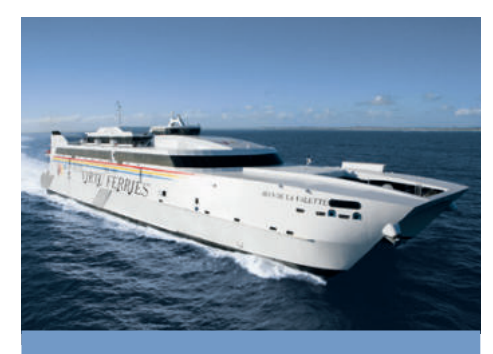
Republic of Malta | "Jean de la Valette", Virtu Ferri 4x Series 20V 8000 M71L @ 9,100 kW each