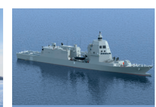
Italy | Italian Navy | "PPA" class 2x Series 20V 8000 M91L @ 10,000 kW