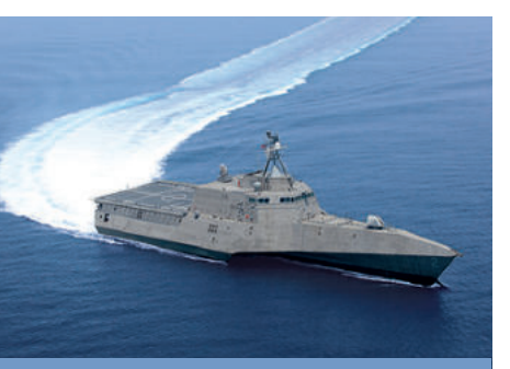
USA | US Navy | "Independence" class (LCS 2) 2x Series 20V 8000 M91L @ 9,100 kW each

The few selected examples intend to give you a quick idea of the variety of engines and propulsion systems as well as the many application areas.