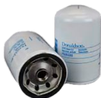
Air/Oil Separator P506086