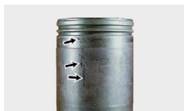
Example of cavitation corrosion