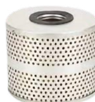
KW P/S Filter P550637