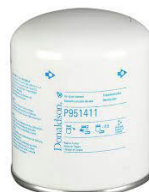
DAF Air Dryer Filter P951411