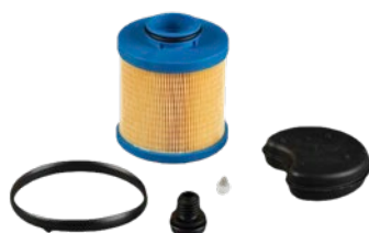
AdBlue Filter Kit X770733