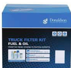
CF85-XF105 e4/e5 X900135