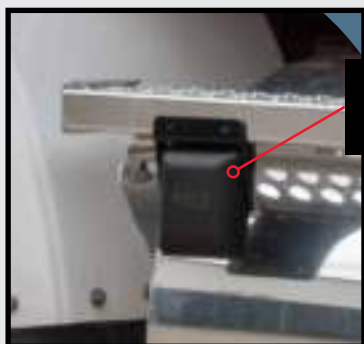
SIDE FACING RADAR

The blind spot monitoring system scans the area alongside the truck, at all times and in all weather conditions. Drivers will be alerted, visually and audibly, to objects in the system's detection zone, assisting with the prevention of collisions when changing lanes or turning at intersections.*