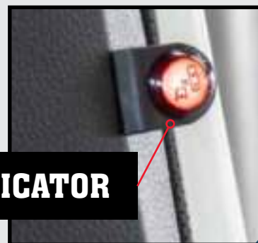
BLIND SPOT INDICATOR