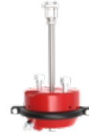
Meritor Red Service Chamber 24