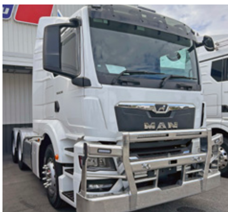
NEW TRUCK MAN TGS 26.540