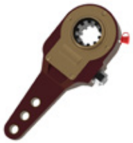
Meritor Red Slack Adj 5" / 6" / 7" 10SP 19mm