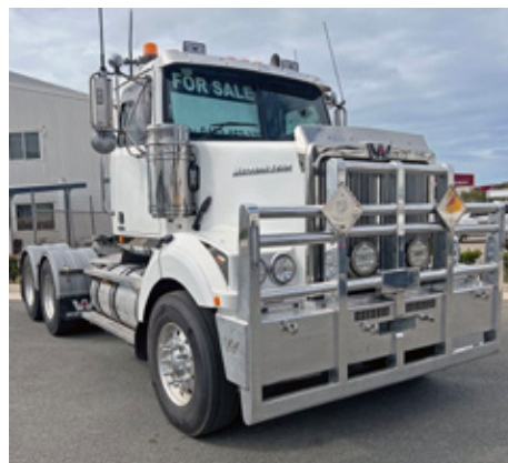
USED 2020 WESTERN STAR 4800