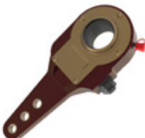
Meritor Red Slack Adj 5" / 6" / 7" 28P 19mm