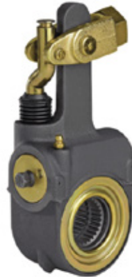
Auto Slack Adjuster 28SPL 1 1/2"