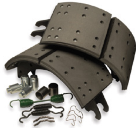
Meritor Red Brake Shoe Kit 16.5" x 5"