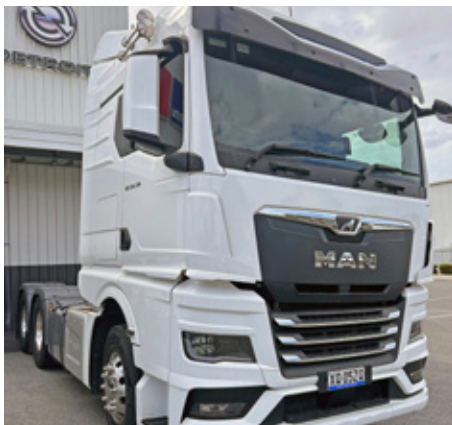
EX DEMO MAN TGX 26.510