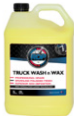
Truck Wash & Wax 5L RDPTWW5L