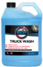
Truck Wash 5L Premium RDPTW5L

The new RDP cleaning range offers premium grade products, that are cost effective, easy to apply, and long lasting. MSDS are available online or on request. Speak to the team at Penske Mackay for more info on our RDP cleaning products range.