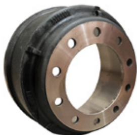
Brake Drum Rd 10 Stud 285