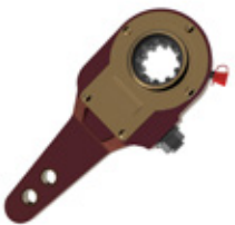
Meritor Red Slack Adj 5.5" / 6.5" 28SP 19mm