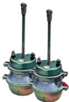
RDP Brake Chamber 24/30

Penske's own brand, top quality at discounted prices.