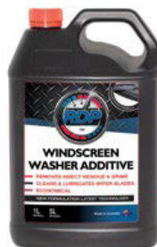
Windscreen Washer Additive 5L RDPWWA5L