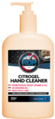
Hand Cleaner 500ml RDPHC500

RDP Citrogel hand cleaner is a premium grade heavy duty hand soap containing high quality citrus oils and a fast-working pumice-grit abrasive. Using natural ingredients from oranges and lemons, Citrogel contains no petroleum solvents and does not harm the environment or your hands. Our range of naturally derived products are perfect for heavy-duty cleaning of hardworking hands in mechanical and industrial workshops. Speak to the team at Penske Mackay for more info on our RDP cleaning products range.