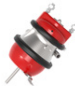
Meritor Brake Chamber BPW Type