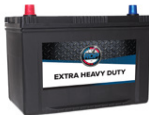
Popular 4WD Battery N70ZZ, 12V 850CCA, 2 Year Warranty