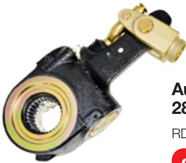
Auto Slack Adjuster 28SPL 5.5"

Penske's own brand, top quality at discounted prices.