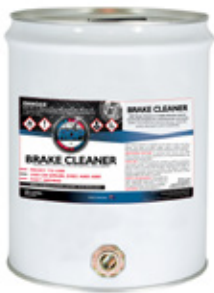
Brake Cleaner 20L RDPBC20L