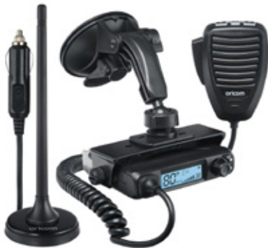
Oricom Plug and Play 5W Micro UHF CB Radio