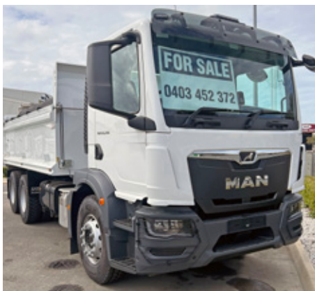
NEW TRUCK MAN TGM 26.290