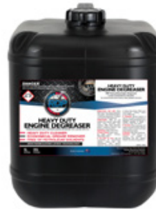
Engine Degreaser H/Duty 20L RDPHDD20L