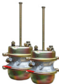
RDP Brake Chamber 30/30