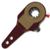
Meritor Red Slack Adj 5.5" / 6.5" 10SP 19mm