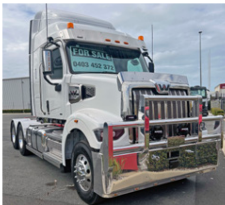
NEW TRUCK WESTERN STAR 48X