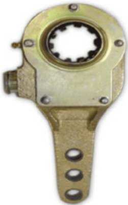
Slack Adjuster 10SPL 1 1/2" 3 hole