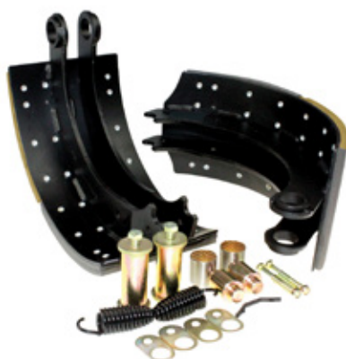
Kit Q Brake O/H 16.5" x 7" S/Serv