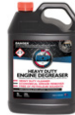
Engine Degreaser H/Duty 5L RDPHDD5L