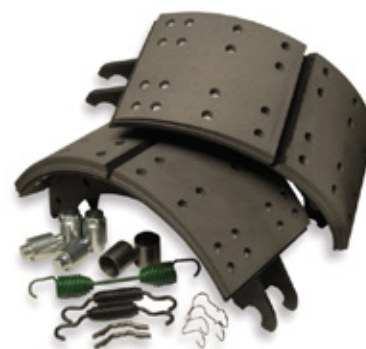
Kit Q Brake O/H ROC 16 1/2" x 7"