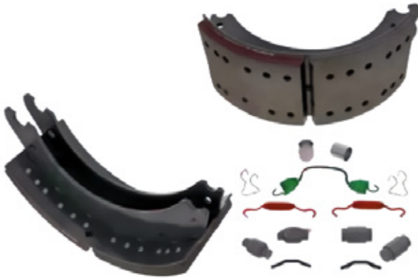
Meritor Red Brake Shoe Kit 16.5" x 6"