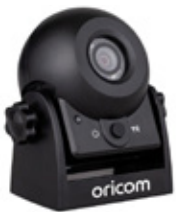
Wireless Reversing Camera with Magnetic Base