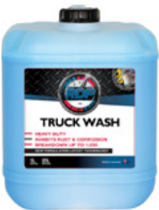
Truck Wash 20L Premium RDPTW20L