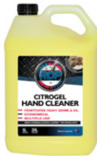
Hand Cleaner 5L RDPHC5L