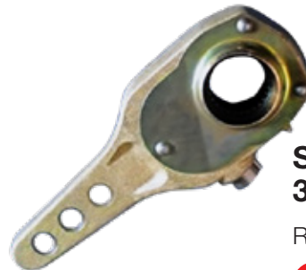
Slack Adjuster 3 Hole 28SPL 1 1/2"