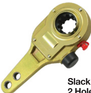
Slack Adjuster 2 Hole 10SPL 1 1/2"