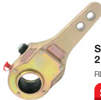
Slack Adjuster 2 Hole 28SPL 1 1/2"