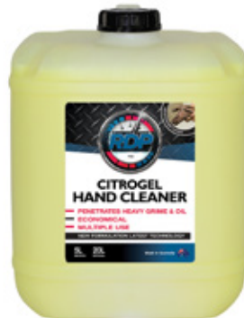
Hand Cleaner 20L RDPHC20L