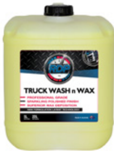
Truck Wash & Wax 20L RDPTWW20L