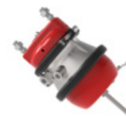
Meritor Brake Chamber BPW Type