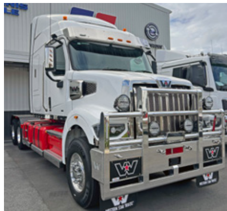
NEW TRUCK WESTERN STAR 48X