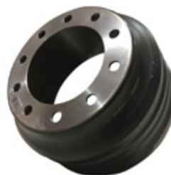
Brake Drum Centri-Lite 16.5" x 7"