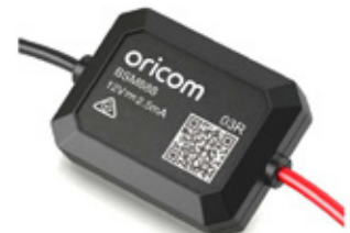
Oricom 12V/24V Battery Sense Monitor