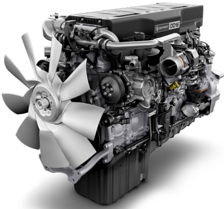
Basic DD16 (Cascadia 126) Service and Chassis Lube