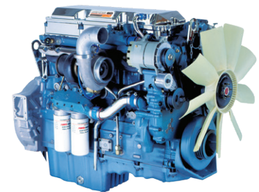
Basic S60 Legacy Service and Chassis Lube