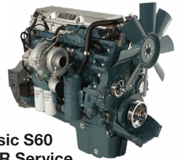
Basic S60 EGR Service and Chassis Lube